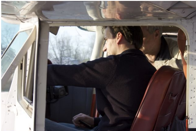
Being prepared for a BFR makes learning better!