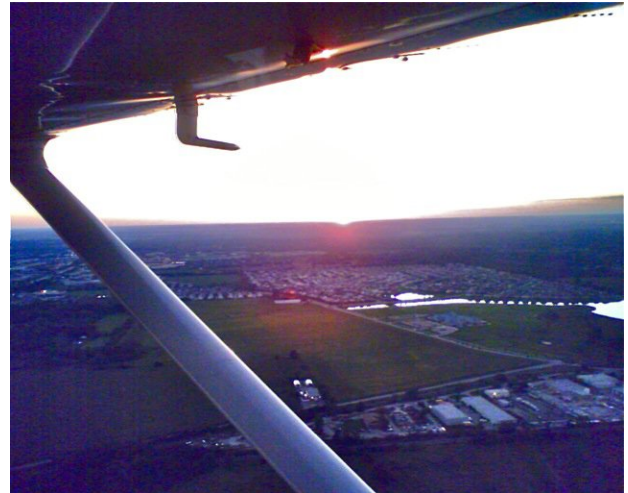
Night and clouds approaching, are you prepared?.

The topic of Spacial Disorientation and medical issues will be discussed. This will be yet another very informative and important presentation! Guests welcomed.